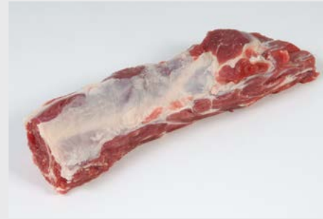
1. Position of neck.